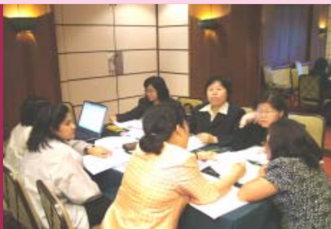
Harmonization meeting on Uncertainty of testing held in Phra Nakhon Si Ayutthaya province on 13-15 June 2005.