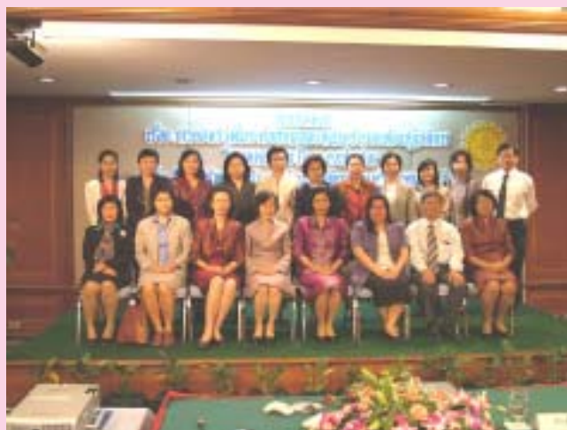
Seminar on benefits of international mutual recognition arrangement of accreditation body held in Bangkok on 22 November 2004